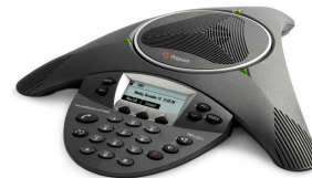
Polycom SoundStation IP 6000