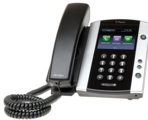
Polycom VVX 500