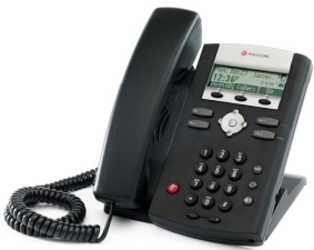
Polycom SoundPoint IP 331