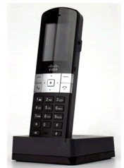
Cisco SPA 302 Cordless