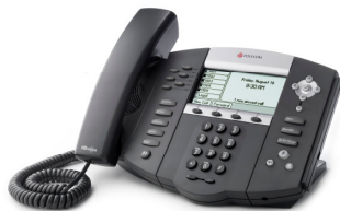
Polycom SoundPoint IP 550 & IP 650